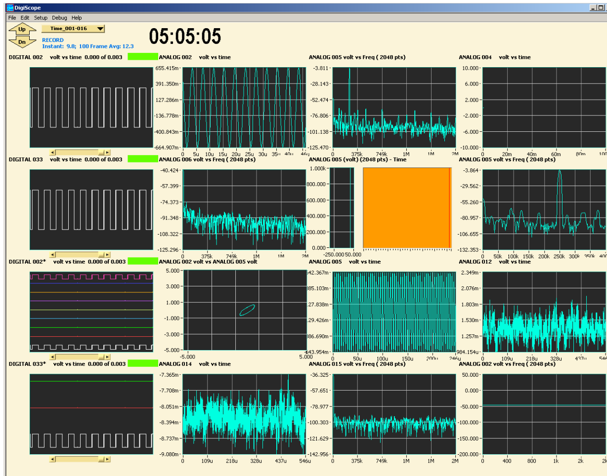
The DigiScope GUI